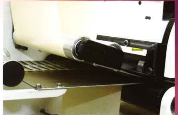
Label insertion on Ti 200

The Omega Ti 200 has been developed to allow label converters to answer the customer's demand for RFID and smart labels. The Ti 200 is an entry-level machine which takes rolls of finished printed die cut labels & inserts security technology in a single pass. Its ease of use and low investment gives easy access to this exciting and rapidly expanding market. It is not dependant on frequency or footprint and is capable of integrating RFID & EAS tags and other types of inserts or labels.